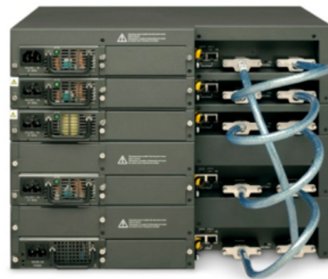
ERS 5600 Stacking Cable Interconnection

From a management perspective, our Stackable Chassis appears as a single networking entity – utilizing only a single IP Address. This can significantly reduce the number of switches to be managed within the network as a stack of up to 8 switches can be managed just as easily as a single switch. Distributed real-time monitoring of the Stackable Chassis also provides an at-a-glance view of operational status and health which