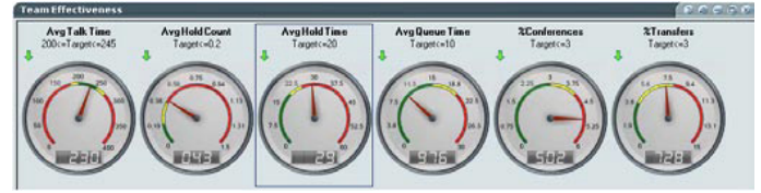
Quality Optimization Dashboard: A Comprehensive Window into Quality KPIs